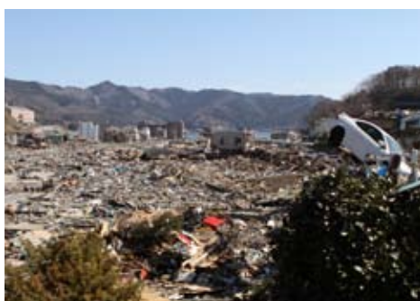
The sea which sustains coastal communities like Ishinomaki has now laid waste to them.