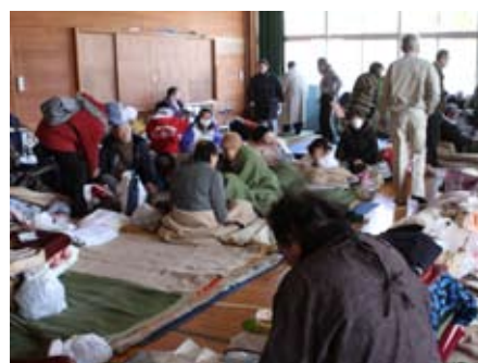
A gymnasium provides shelter but precious little privacy for survivors.