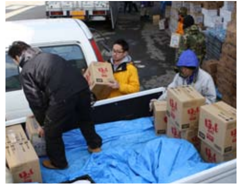
Goods by the pallet-load all bound for Tohoku.

The city suffers from a serious lack of manpower, as 30% of the city's civil servants have been killed and many of the survivors remain in a state of shock. As a result, local authorities have been slow in putting a functional local emergency response in place, with reduced capacity to receive and coordinate assistance offered by relief groups and Peace Boat has stepped in to lead the coordination. During its assessment mission, Peace Boat found that only four out of the then 170 evacuation centers in and around Ishinomaki had an organized food distribution system in place. Outside the shelters, thousands of individuals and families remain in their damaged homes or cars without any infrastructure or secure access to food and water. The state of the roads and an acute gasoline shortage is hampering movement and assistance to survivors.