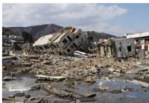
Rubble, trash and puddles of stagnant water abound in crisis-hit Ishinomaki.

Upon consultation with local authorities, Peace Boat has established a base camp in the city of Ishinomaki, and is working with the town's Social Welfare Council on overall coordination of relief efforts in the city.