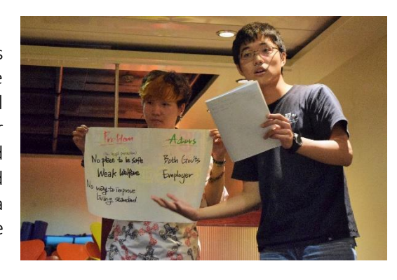
SESSION 3-2: MISSING BOUNDARIES? MIGRATION FOR FILIPINOS

In this session, Kyungmook introduced various case materials to foster intercultural understanding. Students first used the cases to discuss complex but prevalent issues, such as racial identities, and then developed their own cases for similar education purposes. Students divided into two groups and each came up with a scenario involving identity conflicts and clash of perspectives. Lastly, they engaged in a case of a migrant worker in Singapore, to prepare for the exposure programme.